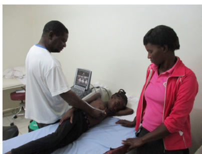
Doing an ultrasound on a patient with a heart problem